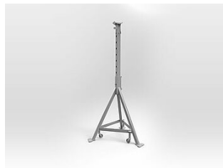
HS08LR support stand, 8.2 t, 1260-1990 mm