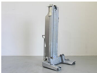
EHB907DC01-H-VZ Hot galvanisation per column EHB90xDC