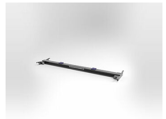
EHB905TR113000 Crossbeam, 11 t, length 3000 mm