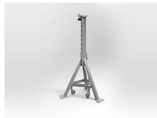
MS08LR support stand, 8.2 t, 790-1270 mm