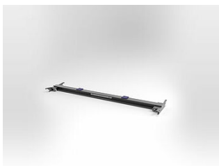
EHB905TR113000 Crossbeam, 11 t, length 3000 mm