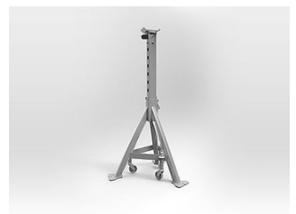
MS08LR support stand, 8.2 t, 790-1270 mm