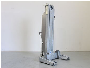
EHB907DC01-H-VZ Hot galvanisation per column E-HB90xDC