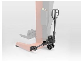
EHB907TDH hydraulic pallet jack