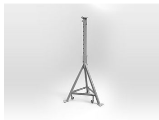
HS08LR support stand, 8.2 t, 1260-1990 mm