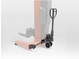
EHB907TDH hydraulic pallet jack