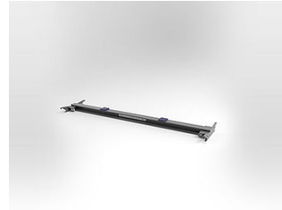
EHB907TR17 Truck crossbeam, 17 t, length 3000 mm